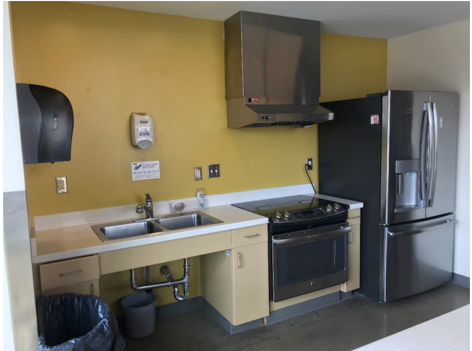
Kitchen facility in Busch House.

be purchased at local thrift shops (list provided in Appendix III) at low cost. As the course continues, students may also be able to purchase used equipment from former students.