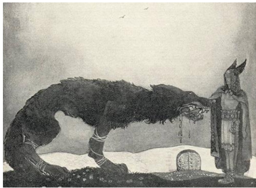
Týr and Fenrir by John Bauer, 1911

What do we know about Thor and Odin, and how do we know it?